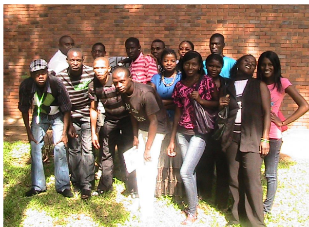
PART OF THE NAMIBIAN STUDENTS WHO RECENTLY ENROLLED WITH MSU